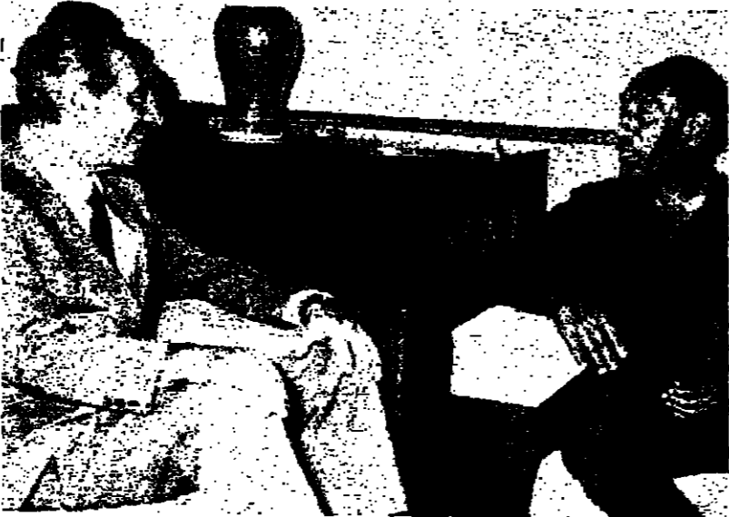
Labour Party chairman Shimon Peres chats with Egyptian President Anwar Sadat during their meeting yesterday at Sadat's Alexandria summer palace.